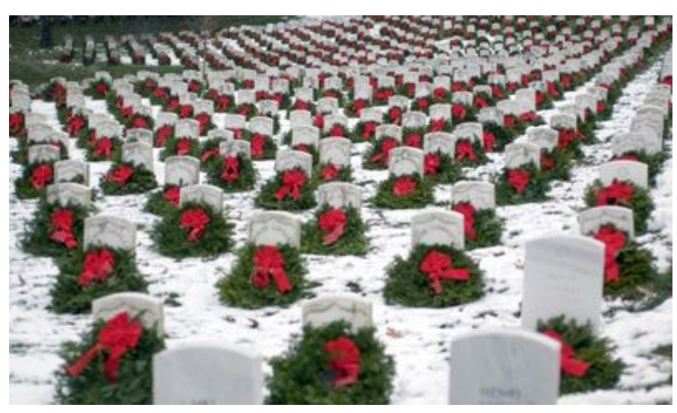
Support Wreaths Across America