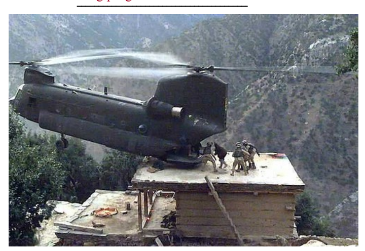
AFGHANASTAN HELICOPTER EXTRACTION 2012

ime to Make Arrangements for the 2012 ADVA Reunion: Times awaistin for making plans for the 2012 ADVA reunion in Atlanta, GA. This note is intended to alert you to join us for a most anticipated "Hot" time in "HotAlanta". Atlanta is chock-full of fun things to do and see. It is the capital city of the South making it a well traveled tourist adventure land. The ADVA staff is working to make this year's event one that everyone will long remember. We are scheduled to participate in the dedication of the Americal Division monument in the "Walk of Honor" near the newly opened National Infantry Museum at Fort Benning. As part of this memorable event the attendees are invited to eat lunch at the 2/46<sup>th</sup> Infantry Regiment Mess Hall. What a treat this will be for the ladies who have seldom had the opportunity to dine in this fashion. The lunch may even be an experience for all of us "Grunts". An application is part of your latest Americal Journal. You can also find an application via our Chapter and ADVA WEBSITES. Make your reservations early. Let's make this another banner reunion. Our annual membership meeting will also be conducted at this time. We're adding a "Hospitality Room" for Chapter's use during the reunion. Look at our Chapter website for additional information or go directly to the Americal Division Veterans Association website http:// www.americal.org/programs/reunion.html